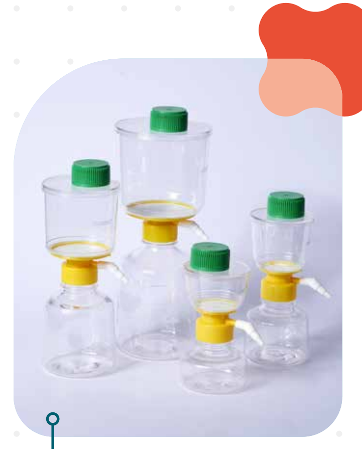
Image shows caps for securing the lower bottles when full, placed on top of each unit.