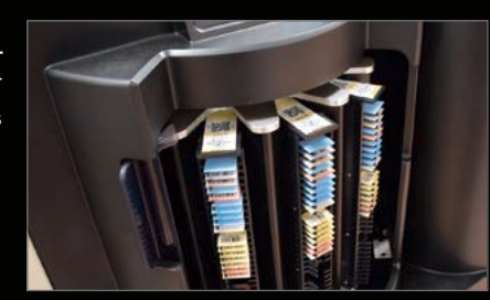
Barcode management for each cassette

Slide scan mode is independently manageable for each cassette labeled with a unique barcode. It is useful when different kind of tissues or stains included in one batch of scan.